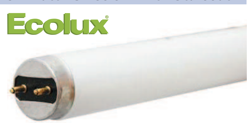
ECOLUX® WITH STARCOAT™ THE SUPERIOR REDUCED MERCURY T8 LAMP