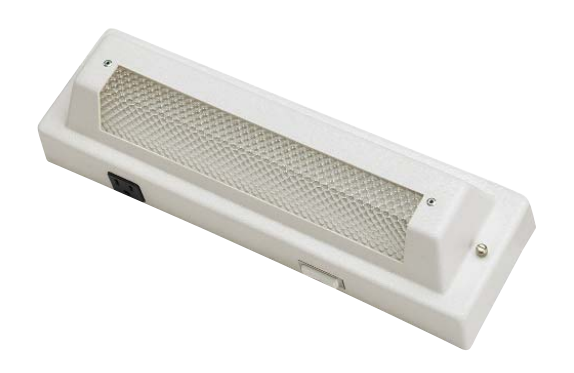
Half cut-out lens shown

DESCRIPTION: The LFBM Series is an interior below-deck fluorescent fixture suited for berth/mirror lighting.